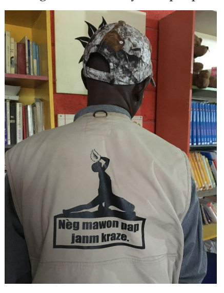
Image of Haitian maroon revolutionary "The spirit of the Haitian people will never break."

Meanwhile people continue to protest the August 15 parliamentary elections, which had been widely reported to be even more problematic, but haven't yet been mandated for in depth investigation. Haitians are relentlessly demanding that their votes be counted.