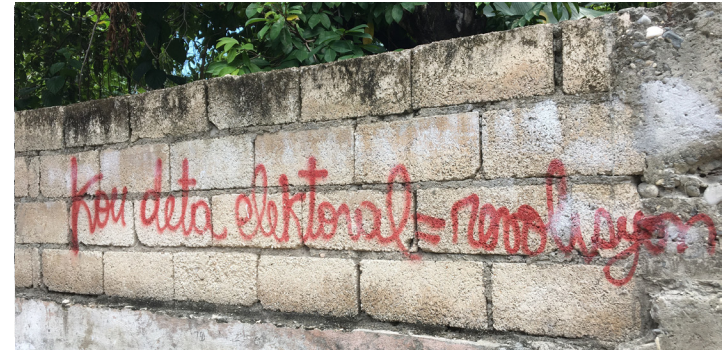
Graffiti in Jacmel: "Electoral coup d'etat = revolution"

The October 25, 2015 first-round presidential election was riddled with massive irregularities, voter intimidation, ballot-box stuffing and tampering with tally sheets, as has been widely reported and documented. People we met with from different sectors, including two of the presidential candidates, affirmed the nature and extent of the electoral fraud. Yet the US has pushed for a quick run-off between the ostensible top two vote-getters, which Haitians have successfully resisted with persistent, large scale street demonstrations.